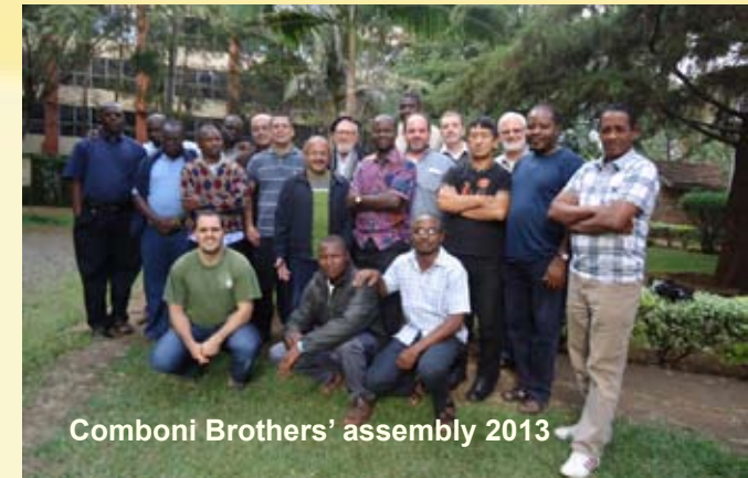
Comboni Brothers' assembly 2013

First mission: a time of full immersion in mission work that leads to the Final Vows.